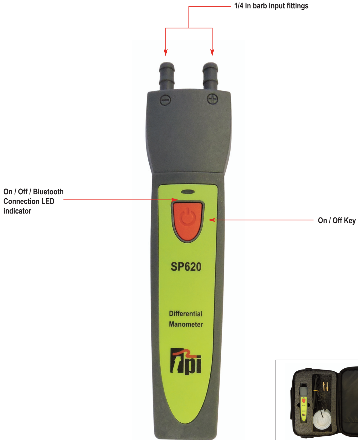
SP620 Photo Actual Size

L x W x D 6.7" x 1.5" x 0.75" 169mm x 39mm x 19mm