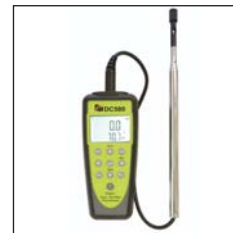
DC580 and hot-wire probe