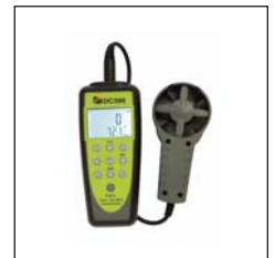
DC580 and vane probe