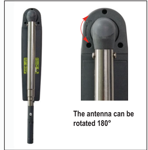
The antenna can be rotated 180°